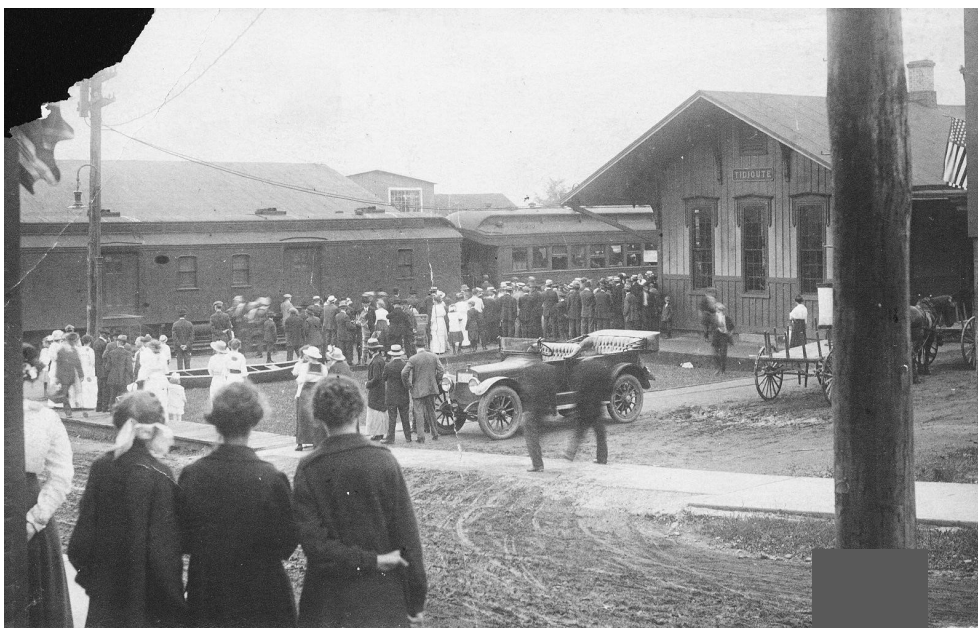
Tidioute Railroad Depot

The Tidioute Railroad Company was incorporated on March 15, 1867. The Commonwealth of Pennsylvania granted the right to connect the Warren and Franklin Railroad at Tidioute. With the discovery of oil at Drake's Well in 1859, the need to create more efficient travel became a high priority, eventually providing elegant passenger transportation to Pittsburgh or Buffalo. Rail service ran through Tidioute from 1868 to 1976.