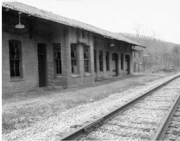
Sheffield Pennsylvania Railroad Station

The depot is open to the public every National Train Day in May.