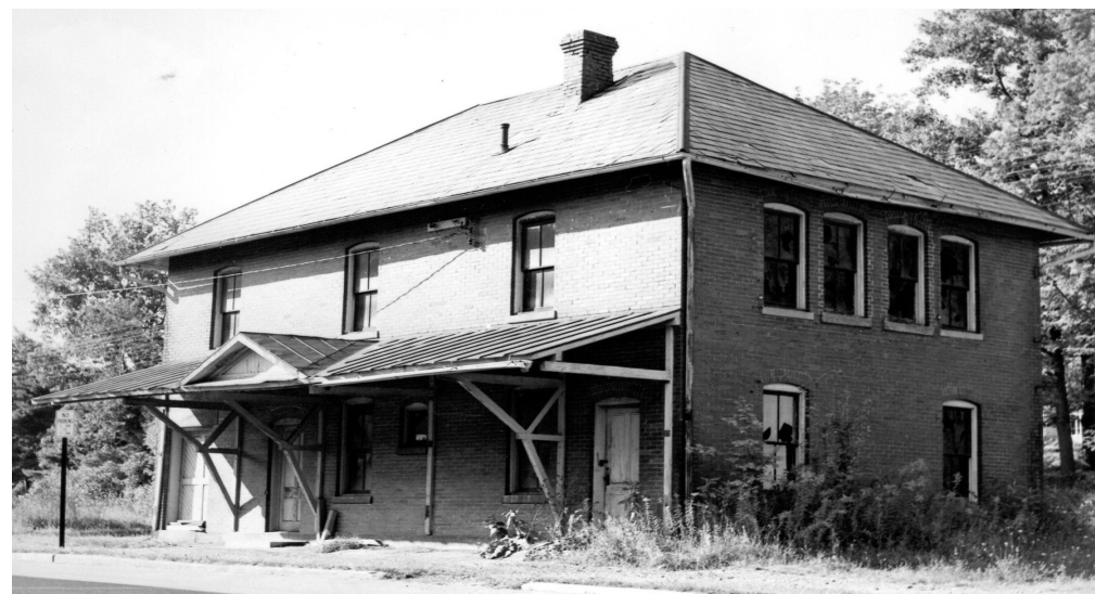
Tionesta Valley RR Depot—removed in 1968 Photo by Tom Curtin, 1967